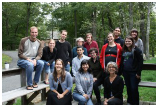
Groundswell 2011 Gathering

The new Groundswell website includes a comprehensive, multi-media report synthesizing the Groundswell discussions. We expect the site to serve as a resource for practitioners and a hub for ongoing network activities and communications. Indeed, coming out of the gathering, participants expressed a high level of interest in expanding the network and creating more spaces for exchange; plans are in the works for a second face-to-face gathering in 2012, a series of practitioner webinars, and the development of a curriculum/toolkit to compile and share strategies for using oral history as a method for social change.