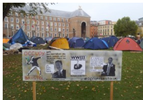
Occupy Bristol, which was served an eviction notice in January 2012