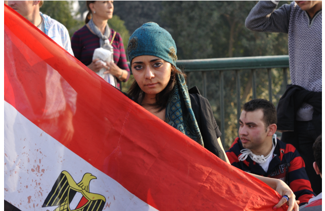
A protester shows her blood splattered flag.

papers, journal articles, and presentations. Over half of these works are interviews and audio documentaries submitted by students enrolled in oral history and journalism courses. The students interview other students, politicians, activists, local business owners, journalists, family members, and faculty on a topics ranging from the use of Twitter during the 18 days of demonstrations to the Muslim Brotherhood's role in democratic governance.