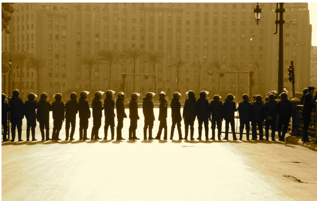
Policemen forming a barricade.