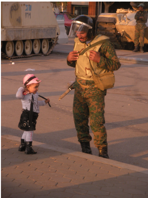
Soldier talking to a little girl in front of the Ministry of Information.