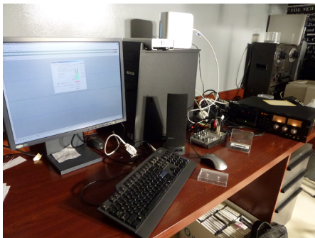
Digitizing an United Jewish Appeal-Federation of New York oral history, using the Sound Forge audio editing program

sible online in alphabetical order, through the Center for Jewish History's Digital Collections, at access.cjh.org . While the archival material is being digitized, the physical collection is unavailable, but researchers interested in the collection can contact reference@ajhs.org for further information or questions regarding the UJA-Federation oral histories.